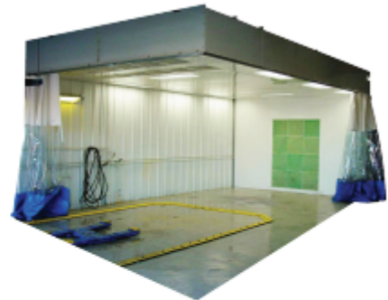
RTT Limited Finishing Prep Stations are a convenient way to prep parts with easy slide curtain.